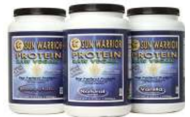
3 yummy flavours Chocolate Natural Vanilla